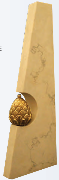
Grande Pinnacle Award

Immediate MIA Past President Rugo Stone LLC 7953 Angleton Court Lorton, VA 22079