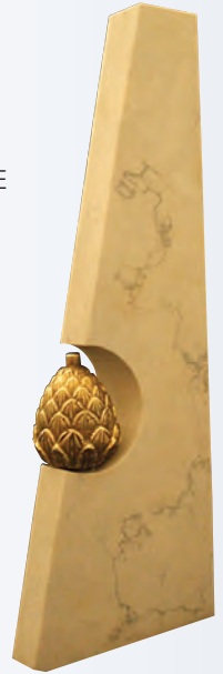
Grande Pinnacle Award

Immediate MIA Past President Rugo Stone LLC 7953 Angleton Court Lorton, VA 22079