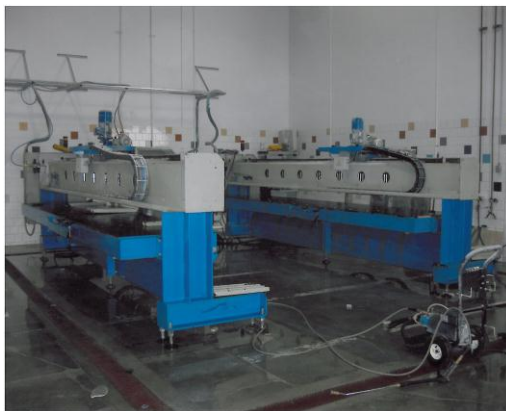
Remediated water is returned to the processing area and reused in such applications as the polishing stage pictured here.

The water system at the fabrication shop utilizes a closed-loop system combined with an automated flocculent injection system and filter press. Spent water is collected and directed to an in-ground storage tank from which it is pumped into a funnel-shaped silo. Flocculent is added to the water in the cone, causing the particles to clump and settle to the bottom. The aggregated mass is then pumped to a filter press where the water is squeezed out until the particulates become a solid brick. Clean water is piped into the processing facility for reuse, while the bricks are transported back to the local quarry where they are laid as road base.