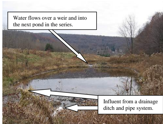
Figure 2. Simple settling pond system.

Figure 2 illustrates a basic settlement pond system. Spent water enters on the left, slowly flows through the basin or series of basins [typically at a maximum rate of 1ft/second (Linsley et al. 1992)] and is pumped from the end of the system for reuse. As the water moves through the ponds, particles settle to the basin floor at rates that are a function of each particle's mass.