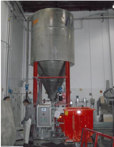
Silo where flocculation and particle separation occur. The red apparatus to the right is the filter press.